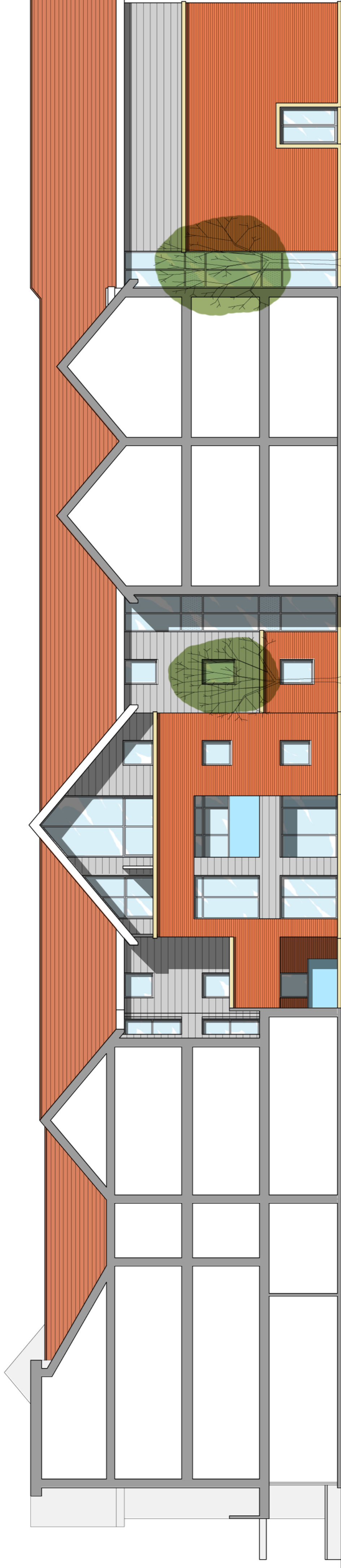
SECTION 2 LOOKING NORTH

□ Indicates Opaque Glass Spandrel Panels within curtain walling